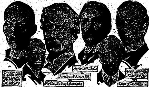
Here are some of the new members in the British cabinet founded by Andrew Bonar Law...