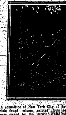
A committee of New York City of six is now in charge of the miners evicted from homes owned by the Berwind-Whitcomb company. The Berwind-Whitcomb company is a coal company.

SEEK NEW QUARTERS FOR CHAMBER, FARM BUREAU