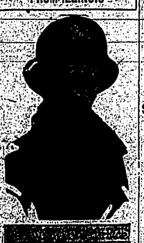
Mrs. Winifred Mason Eddowes, daughter of the late Congressman William M. Mason, of Illinois, has been elected to succeed her father.