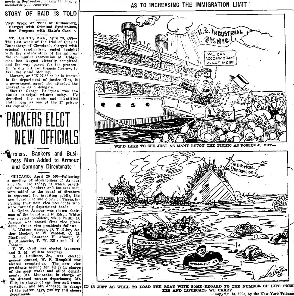
WE'D LIKE TO SEE JUST AS MANY ENJOY THE PICNIC AS POSSIBLE, BUT—