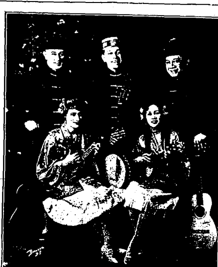
Famous Hawaiian Company Coming to The Orpheum This Week.