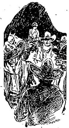
"He Wagered He Would Marry the First Girl Who Arrived at El Cajon."

Mudlene had not time to grasp the sense of his last words. Stewart had impulsively sprung upward, while she calmly, as he looked at Howe Stillwell interposed his huge bulk and wrapped his arms around Stewart. There was