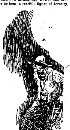
Lower and Lower He Bent, a Terrible Figure of Ferocity.

"Now, both you armed officers of the law, come on! Flash your guns! Throw 'em, an' be quick! Monty Price