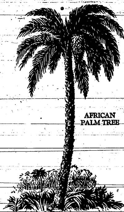
AFRICAN PALM TREE

The only oils in Palmolive Soap are the priceless beauty oils from these three trees—and no other fats whatsoever