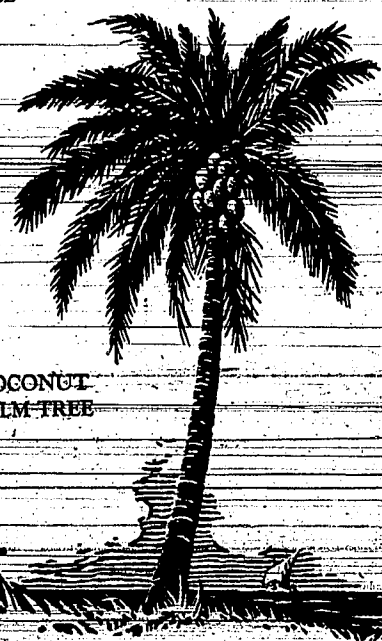
COCONUT PALM TREE

60 years study to insure women keeping "That Schoolgirl Complexion" makes Palmolive safe to use.