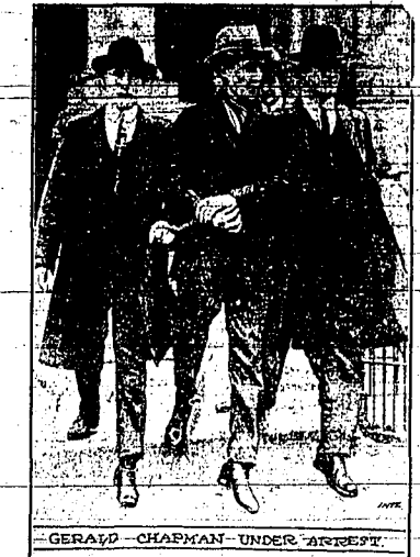
GERALD CHAPMAN—UNDER ARREST