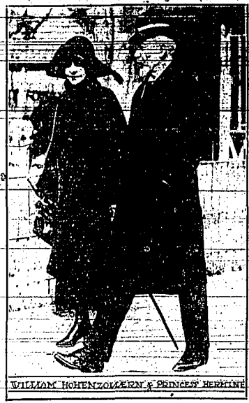
WILHELM HOHENZOLLERN, EX-KAISER OF PRUSSIA