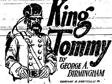
By GEORGE A. BIRMINGHAM

Finland Denies Wooded. "Finland is the most heavily forested country in the world."