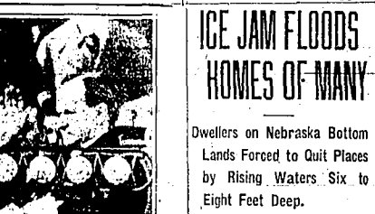
Dwellers on Nebraska Bottom Lands Forced to Quit Places by Rising Waters Six to Eight Feet Deep.

YANKTON, S. D., March 6 (AP)—Flooded into the Missouri river along Nebraska, Nebraska, was still holding fast to its banks, but all bottom lands on both sides of the river is inundated to an average depth of 15 to 20 feet.