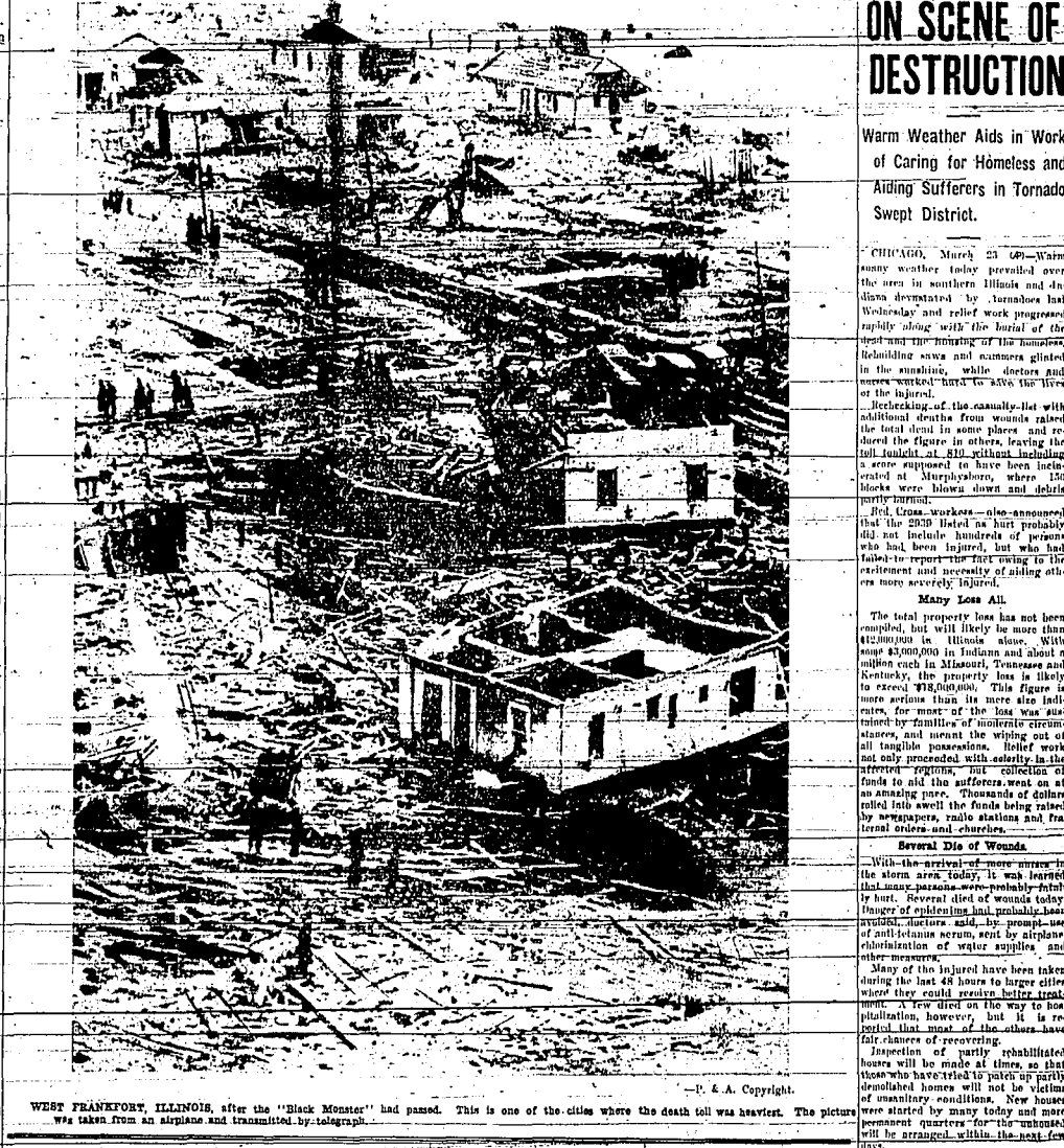
WEST FRANKFORT, ILLINOIS, after the "Black Monster" had passed. This is one of the cities where the death toll was heaviest. The picture was taken from an airplane and transmitted by telegraph.