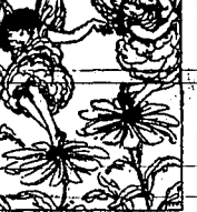
Every Fairy Hopped on a Flower.