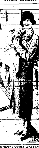
PRINCESS XENIA OF GREECE