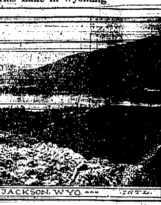
LANDSLIDE AT JACKSON, WYO. WHEN A PORTION OF Sheep Mountain, at Jackson, Wyo. (shown in right of picture) crashed into the Snake River canyon during the early tremors on June 25, the river was dammed and a new lake was formed.

hour of 2:00 o'clock P. M. (Mountain Time) of last night. It was the first of a series of earthquakes that have been occurring in the Snake River valley since June 25.