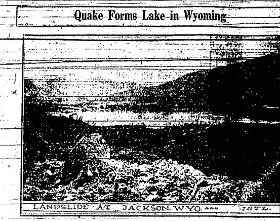
LANDSLIDE AT JACKSON, WYO. WHEN A PORTION OF Sheep Mountain, at Jackson, Wyo. (shown in right of picture) crashed into the Snake River canyon during the early tremors on June 25, the river was dammed and a new lake was formed.

TO OUR SUBSCRIBERS: Men and women who buy their news and who read it in greater numbers than the Twin Falls Daily News.