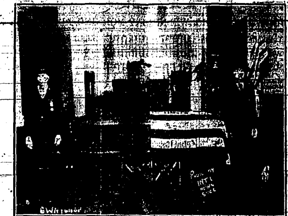
PHOTO SHOWS THE BODY OF William Jennings Bryan lying in state in the New York Avenue Presbyterian Church in Washington, D. C., Spanish-American war veteran acting as guard of honor. This picture was transmitted by wire to International News Service from Washington to Chicago today.