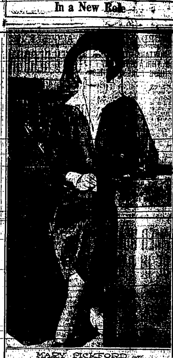
MARY PICKFORD, the motion picture actress, took the witness stand to give evidence at the trial of three men charged with plotting to kidnap her and other screen folk and hold them for ransom.