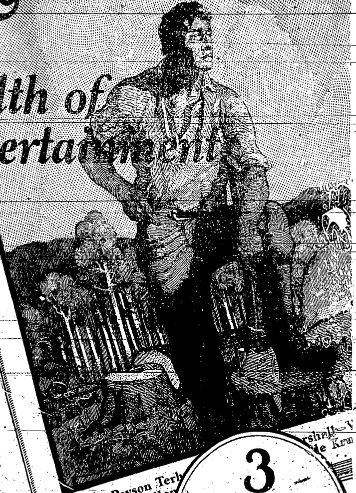
Albert Payson Terhune Andrew W. Mellon