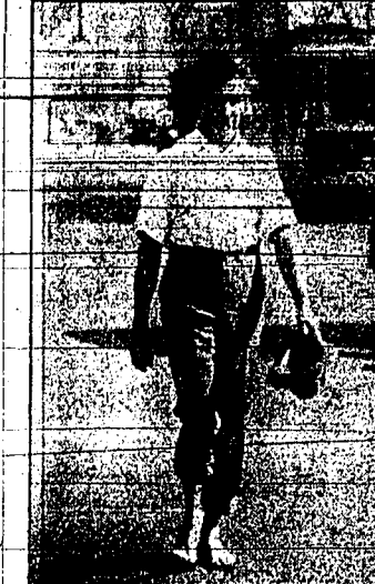
BERNARD MAOFADDEN , millionaire publisher of twelve magazines and "The Father of Physical Culture," is no longer regarded as a crank but as a sincere man who practices the health precepts that he preaches.