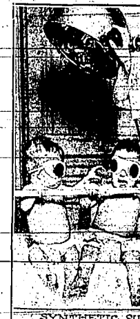
SUFFERING FROM rickets, these Chicago children are being treated under the rays of the big synthetic sun, quartz lights furnishing the rays that cure.