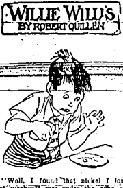
"Well, I found that nickel I lost last week—it was under the collar in my room"

TRACK LAYING PROCEEDING ON SCHEDULE TIME Gap of Less Than Four Miles Remains to be Spanned When General Manager Makes Inspection Trip.