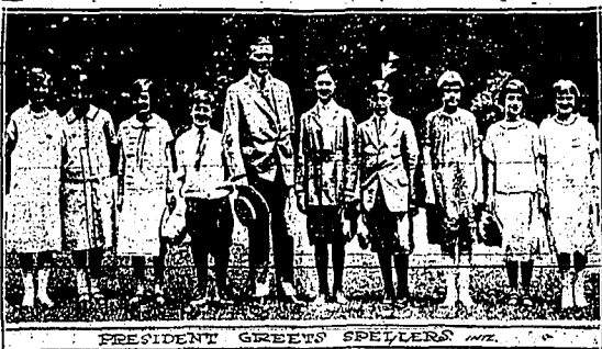
PRESIDENT GREETING SPELLERS