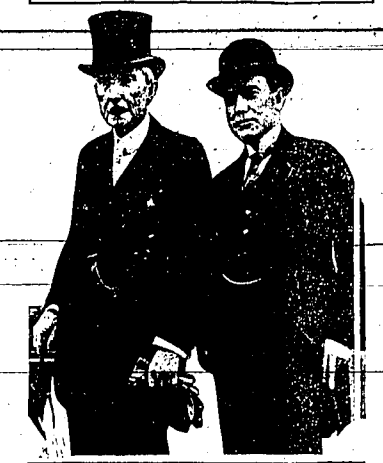
JOHN D. ROCKEFELLER, SR. & JR. JOHN D. ROCKEFELLER, SR. AND JILL, with a third generation member of the family, Winthrop Rockefeller, attended the Park Avenue Baptist Church, New York, known as the "Rockefeller Church," to hear the first sermon there of Dr. Harry Emerson Fosdick, famous modernist pastor-lecturer who demanded and obtained change of size before accepting the call.

The aged old magnate gave away ten new tickets to children at church.