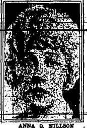
ANNA Q. NILSSON