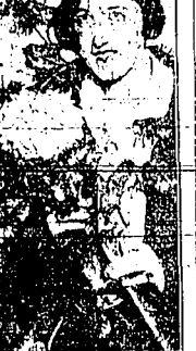
MRS. COOKSEY BLOOM