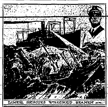
LINER RESCUES WRECKED SEAMEN

BASED on radioed information, this is how the President Harding, fighting his way through the storm to the side of the foundering freighter Ignazio, rescued 27 of all on the troubled waters, about 400 miles from shore.