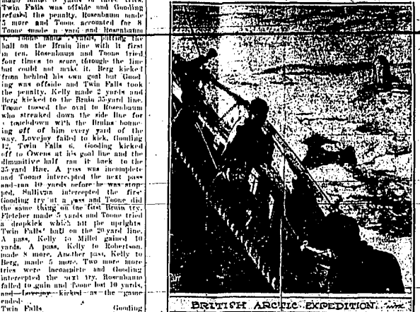
BRITISH ARCTIC EXPEDITION.

COMMANDER WORSLEY'S British Arctic expedition is working its way homeward through the ice, headed for Spitzbergen. While in the northland, a polar bear visited the ship seeking a meal in the form of blubber. Commander Worsley's British Arctic expedition is working its way homeward through the ice, headed for Spitzbergen. While in the northland, a polar bear visited the ship seeking a meal in the form of blubber.