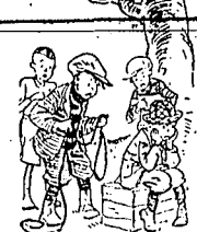
"That new boy wanted to play horse thief with us 'n then he made out like his mother told him he mustn't ever be hung."