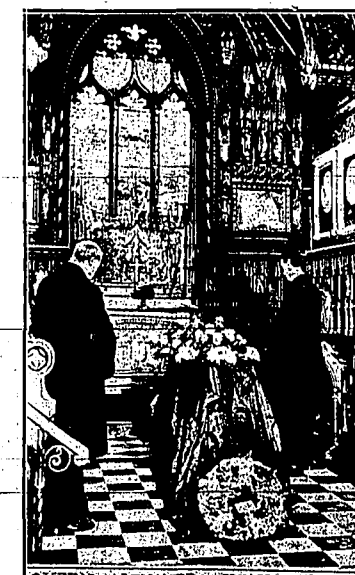
Queen Alexandra, who was slain in the pasting of the Dowager Queen of England. Her body is shown lying in state in the chapel at Sandringham.