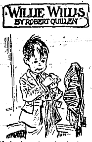
"I found a piece of cake in my Sunday egg that I didn't have room for at the table, but a mouse had-eat a part of it."

George W. Hamilton harvested an average crop that yielded 30 tons per acre. Total of 370,000 bushels of onions was produced on 624 acres, average yield being 600 bushels per acre, according to estimates made by J. E. White. Average sale price was figured at $1.20 per bushel, and total value of the crop at $280,000. The 1925 seed crop was worth $112,000.