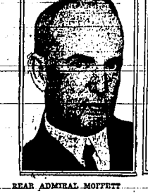
REAR ADMIRAL MOFFETT