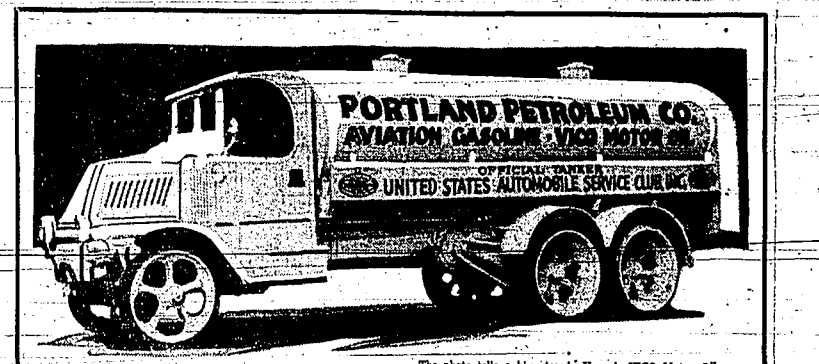
The photo tells a big story! Here is VICO Motor Oil, being distributed in Portland, Oregon, in one of the largest tank trucks handling gasoline and oil in the United States. Capacity, 3,000 gallons.