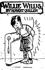
It's awful hard to do my duty sometimes, but Papa don't never feel that way about his duty to his neighbors.