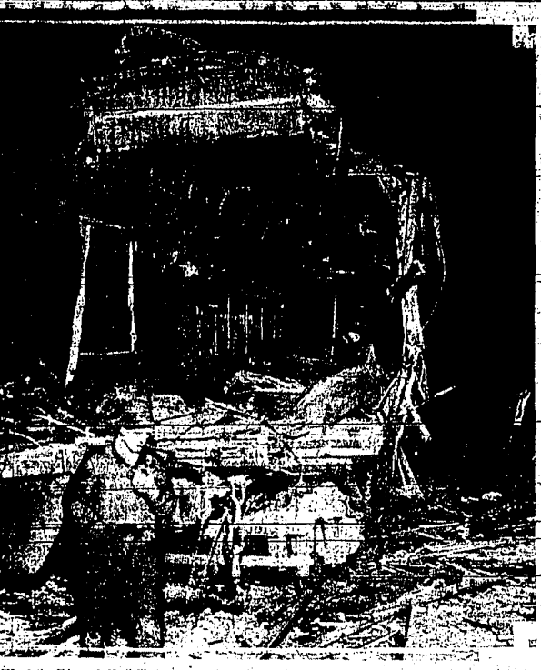
REMAINS OF THE REAR COACH of the Chicago & North-Western Wisconsin resort train after a North-Western suburban train had crashed into it, killing five and injuring fifty, at the Clayburn station in Chicago. The wreck occurred Monday night when both trains were loaded to capacity with holiday travelers.