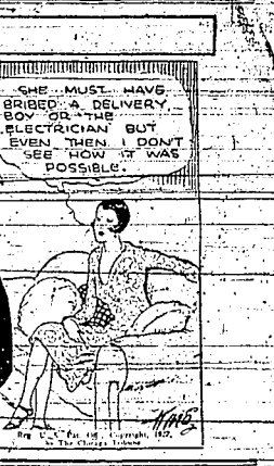
THAT WOMAN TELL YOU AND IF THERE IS ANYTHING SHE'D WOULD BE TO MYSTIFY US.