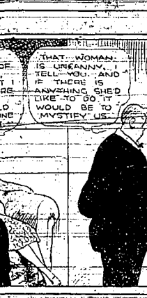
THAT WOMAN TELL YOU AND IF THERE IS ANYTHING SHE'D WOULD BE TO MYSTIFY US.