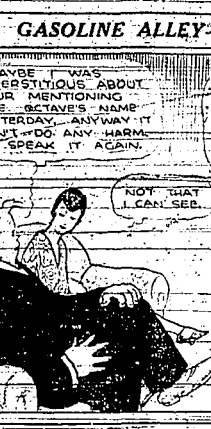
NOT I CAN SEE.