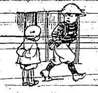
I guess Cain always was mad at his little brother Abel on account of him 'tagging' along every where.