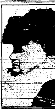
CHARLOTTE OF MEXICO