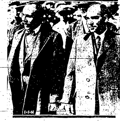
BARTOLOMEO VANZETTI (left) and Nicola Sacco must die the week of July 10, under an order of the superior court of Dedham, Massachusetts. The men were convicted seven years ago for the murder of two men in a robbery at South Braintree, Massachusetts. They say they were framed because of the radical activities.