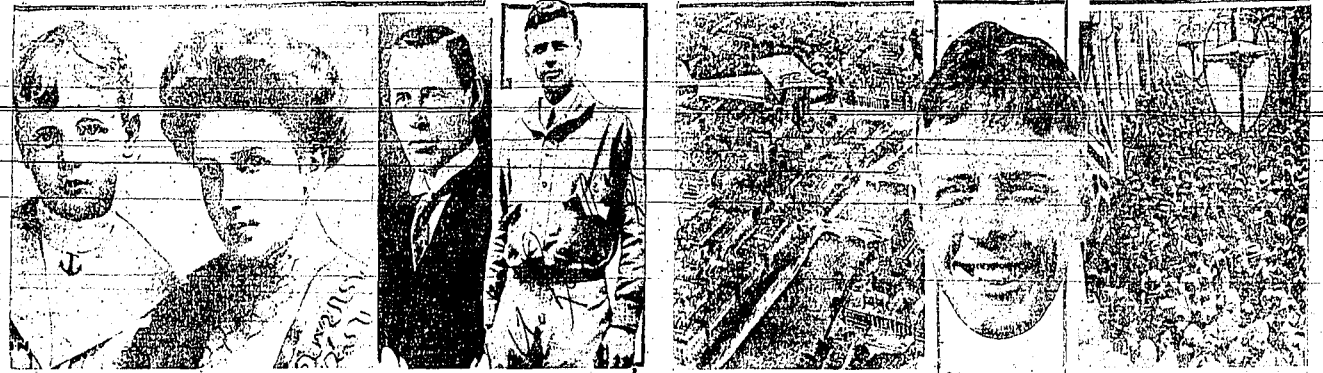
CHARLES AUGUSTUS LINBERGH was born in Detroit, Michigan, on February 2, 1902, to Mrs. Evangelina Land Linbergh, the widow of L. Landbergh, a farmer, and later congressman, of Little Falls, Minn. Pictures above show Charles at an early age, his mother, and his late father, and the young man in his first days as an aviator. Four parachute leaps saved his life on four different times, and he won attention by his skill in handling a machine.