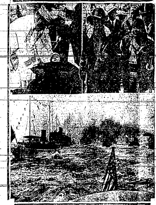
THESE ARE SIDELIGHTS ON Colonel Charles Lindbergh's arrival in New York. Top left, a mob of unidentified women... Below, the spectacular marine display in New York harbor in honor of the flier.