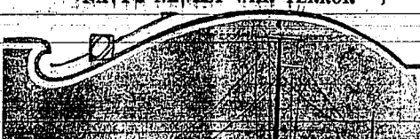
The V-3, latest submarine to be added to Uncle Sam's sea forces. It is really an underwater battleship.