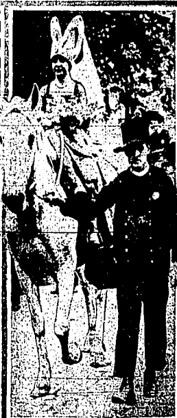
"MISS FRANCE"—France has joined the game of picking most beautiful women. Here's the Queen of Queens being paraded through the streets of Quincy.