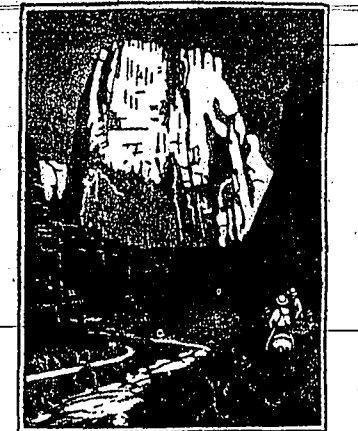
Great White Throne, Zion National Park