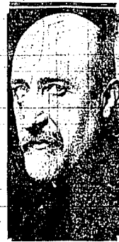
KARL DEITZ, burgomaster of Vienna, appears to be fitting in new power in Europe. Creation of a new constabulary would practically put an army within the city at his command.

Parade The trouble will be on your own resources is that it so often happens when you haven't any.