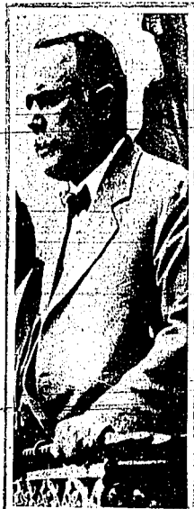
POLITICS—The political pot is boiling in Mexico. General Obregon, one of three candidates for the presidency, is shown addressing crowds from his headquarters in Mexico City.