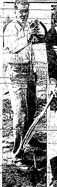
GENE TUNNEY is getting ready to take on Jack Dempsey. New pictures show him in light exercise, tuning up for the heavier grind. He's still at Spratler, N.Y.