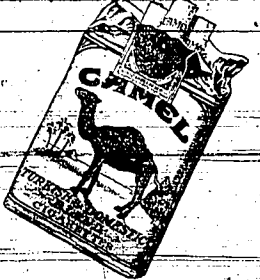
© 1927, W. J. Barnstead Tobacco Company, Buffalo, N. Y.

If all cigarettes were as good as Camel you wouldn't hear anything about special treatments to make cigarettes good for the throat. Nothing takes the place of choice tobaccos.