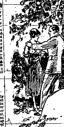
She Hung Her Head and Answered 'My Lips is for the Man I Love'