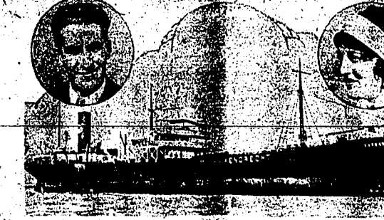
FROTO SHOWS the Dutch steamer that rescued the fliers in distress miles off the coast of Spain.