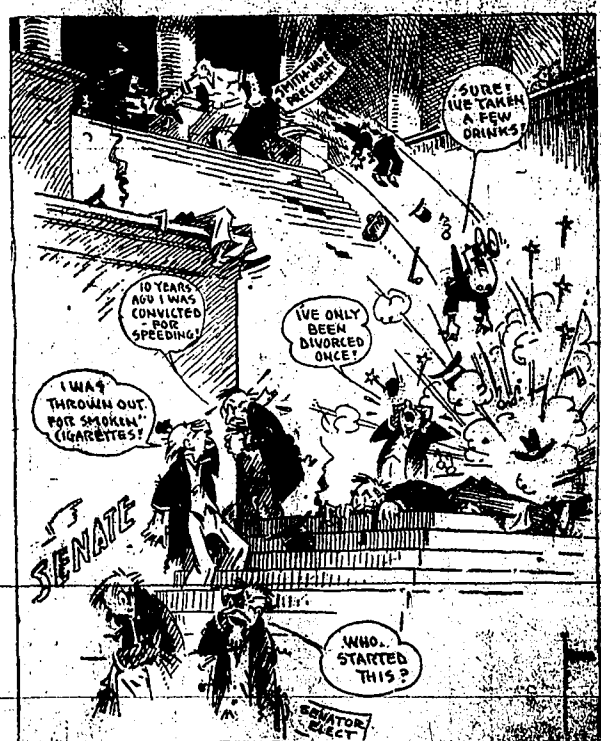
ONCE ESTABLISHED, THAT BOUNCER MAY GROW TOO EFFICIENT

Copyright, 1927, by The New York Tribune, Inc.