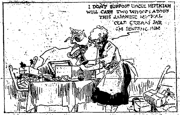
IF IT WEREN'T FOR THE RED CROSS SEALS ON THE WRAPPER