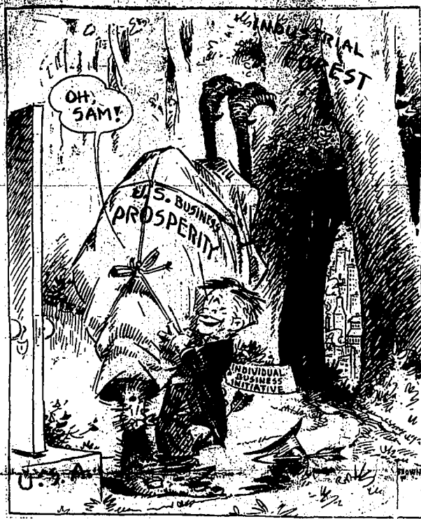
SAME OLD SPIRIT PROVIDING OUR THANKSGIVING INSPIRATION