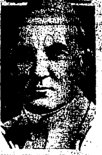
MONSIGNOR RAYMOND BOULEAU (above), archbishop of Quebec, will be made a cardinal by Pope Pius XI. He is announced by Rome. The prelate is a Dominican, was born in 1866, and became an archbishop last year.