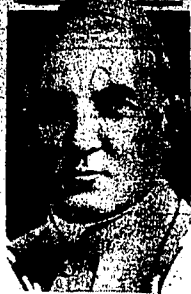
MONSIGNOR RAYMOND BOULEAU (above), archbishop of Quebec, will be made a cardinal by Pope Pius XI, it is announced by Rome. The prelate is a Dominican, was born in 1866, and became an archbishop last year.