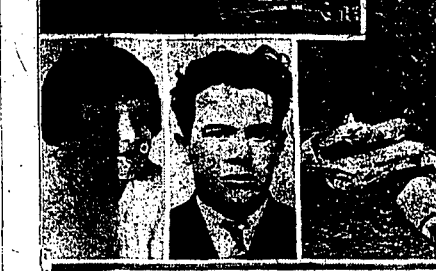
PICTURES OF WILLIAM E. HICKMAN and principals in the case—Upper left: Some of the donations from Los Angeles public to $100,000 fund for capture of kidnaper...