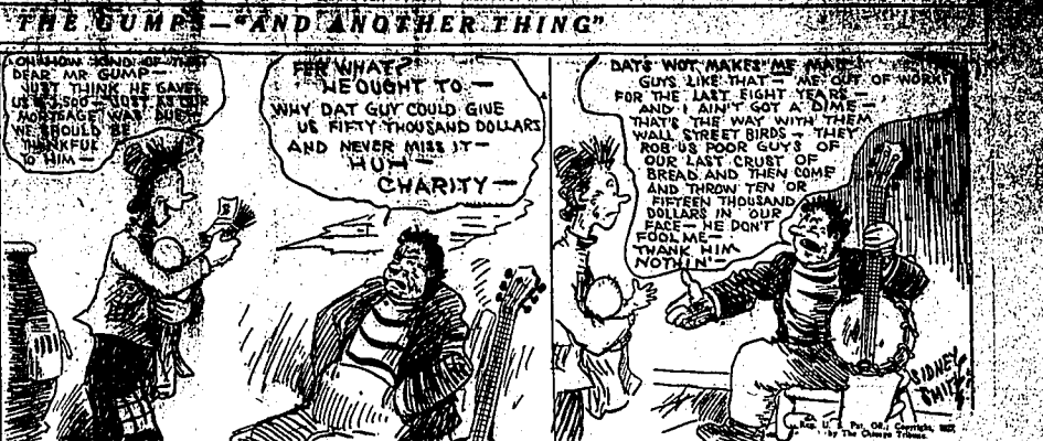
THE GUMP - AND ANOTHER THING