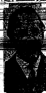
Portrait of a man, likely related to the 'Yankee' article.