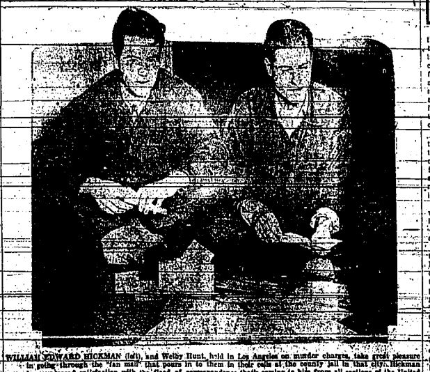
WILLIAM EDWARD HICKMAN (left), and Welby Hunt, held in Los Angeles in murder charges, take their pleasure in going through the fan mail that pours in to them in their cell in the county jail in that city.