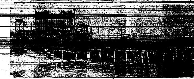
SMOULDERING RUINS of the Casino at Asbury Park, N. J., are all that is left after fire swept through the pleasure resort, also destroying the city radio station, WCAP, and a number of residences, and causing more than half a million dollars in losses.