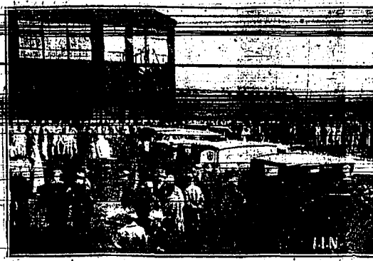
THIS PHOTO, taken at West Frankfort, Illinois, and transmitted over A. T. & T. wires from St. Louis, shows the interior of the mine...