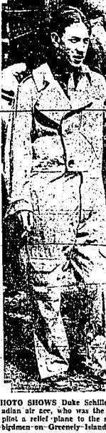
PHOTO SHOWS Duke Schiller, Canadian air ace, who was the first to plot a relief plane to the stranded birdmen on Greeney Island.