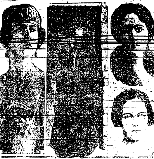
Queen Marie of Rumania, Queen Marie of Greece, Elizabeth of Greece (Upper), Victoria Louise of Belgium (Lower)