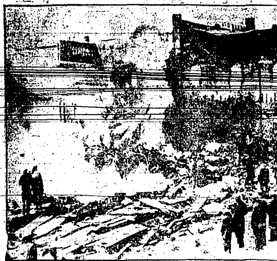
RESCUEES ARE SHOWN searching the ruins for victims of the West Plains, Missouri, dance hall explosion in which 38 lives were lost and 20 injured.