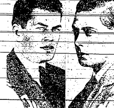
Gene Tunney (left) and the Prince of Wales (right) during their visit to the United States.