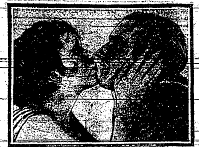
IDAHO.—Tomorrow, Monday and Tuesday—Clara Bow, James Hall in 'The Fleets' at

There was a fire drill yesterday morning during the first hour.