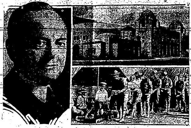
TENTH ANNUAL national convention of American Legion will be held in San Antonio, Texas, October 8-12...