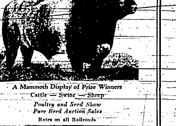
A Mammoth Display of Prize Winners Cattle - Swine - Sheep Poultry and Seed Shows Pure Blood Auction Sales Rates on All Railroads

BOSTON, Dec. 31 (AP)—Prices on all grades of domestic wool with exception of choice line Delaines are higher than at the close of 1927.