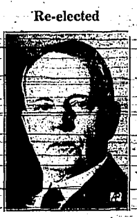
GENERAL PALMER E. PIERCE will again head the National Collegiate Athletic association. He was re-elected at the New Orleans meeting.