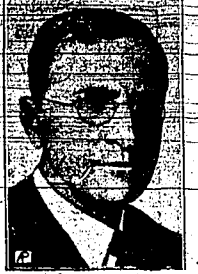
DR. JOSEPH GOLDBERGER of the United States Public Health Service, who discovered the cause and treatment of pellagra, is critically ill at the naval hospital in Washington.