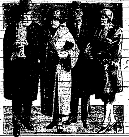
MR. AND MRS. THOMAS A. EDISON as they left Newark, New Jersey, for their winter home at Fort Myers, Florida, with them are Charles Edison, their son, and his wife who told him good bye at the station.