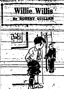
I guess I wasn't polite when I told the new preacher, Manana wasn't all home, but I explained it all right. I told him I thought he was a collector.